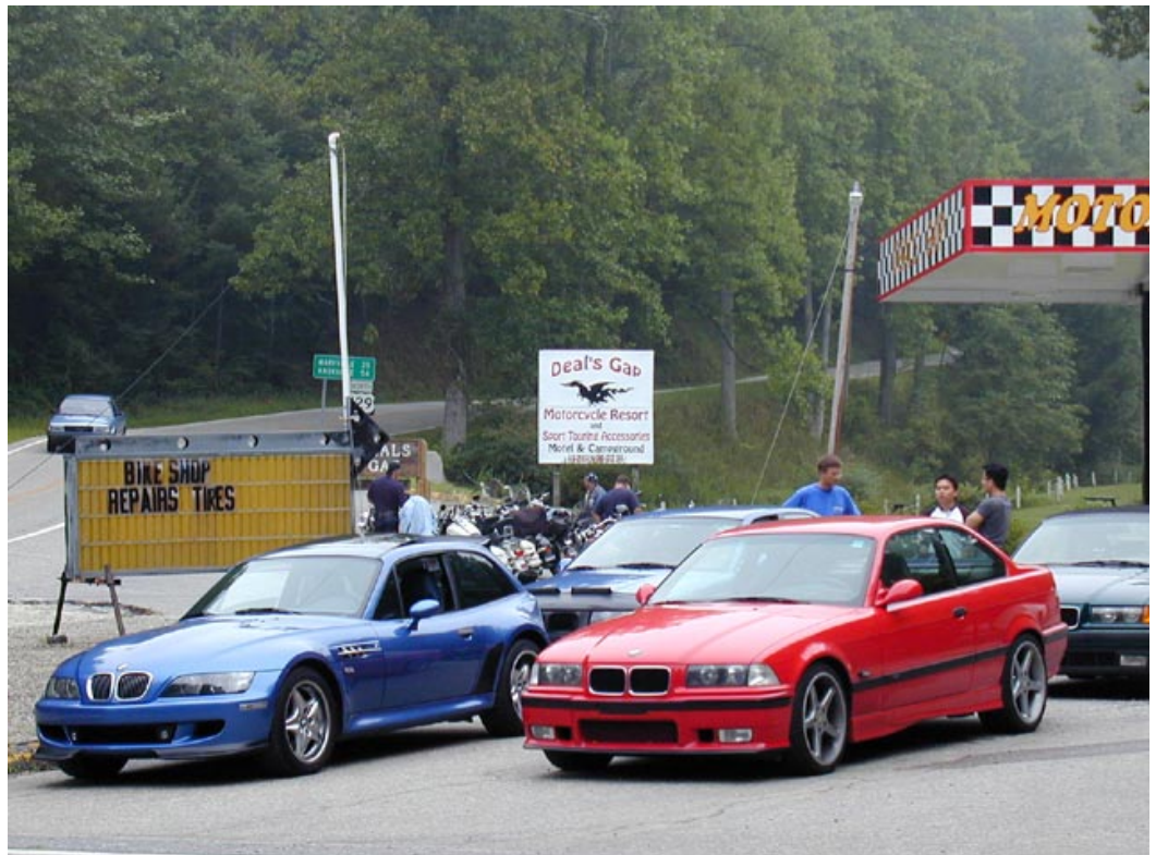
Pit Stop at Deals Gap